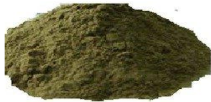
Gurmar Leaves powder