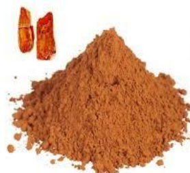
Beejasar Bark Powder