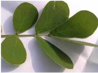
Cassia Tora Leaves