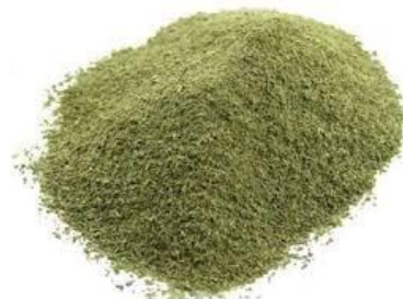
Nyctanthus Leaves Powder