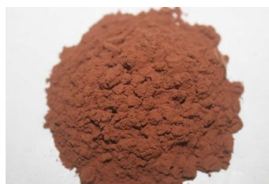
Arjun Bark Powder